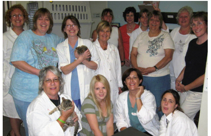
Happy volunteers and veterinary professionals celebrate after the exciting launch of "Wildcat Wednesdays", a high volume spay/neuter clinic organized by the Feral Cat Caregivers Support Group of Community Animal Allies of Niagara.

On July 16th, after weeks of planning, training and growing excitement, Community Animal Allies of Niagara (CAAN) launched it's first "Wildcat Wednesdays" night, a high volume spay/neuter clinic for feral cats, organized by members of CAAN's Feral Cat Caregiver Support Group. Three months later, with seven more successful nights under their belts, a total of 68 cats have been humanely trapped, sterilized, vaccinated, treated for fleas and worms, microchipped and returned to their outdoor homes.