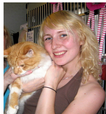
Another happy adoption! "Handsome" the cat is ready to go to his new home.

For more information on volunteering, go to www.caan-catmobile.org , or send us an email at caan-catmobile@hotmail.com .